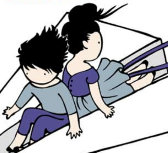
PAPER PLANE RIDE NECKLACE page 83