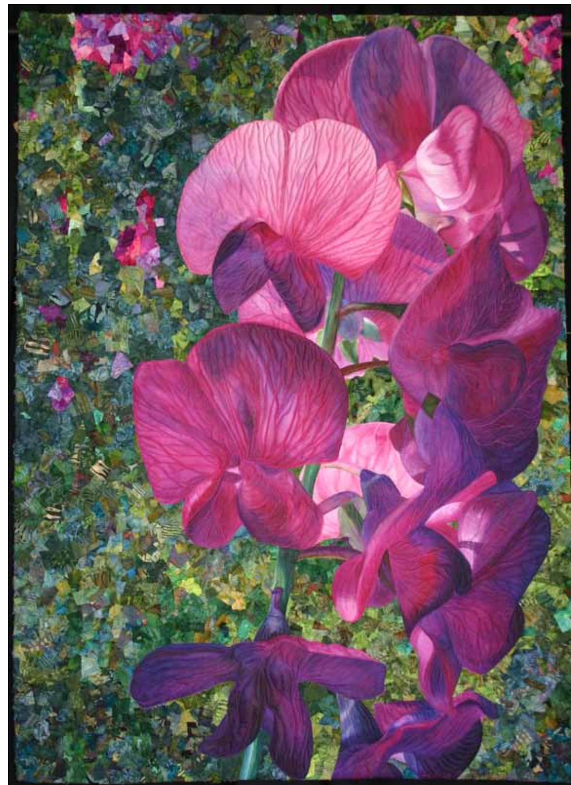
ANDREA M. BROKENSHERE ● JEANENE'S SWEETIE PEAS, 2010 ● 40 x 29 x ¼ inches (101.6 x 73.7 x 0.6 cm) 100% silk, 100% cotton; hand-painted appliquéd, free-motion machine quilted ● Photo by artist