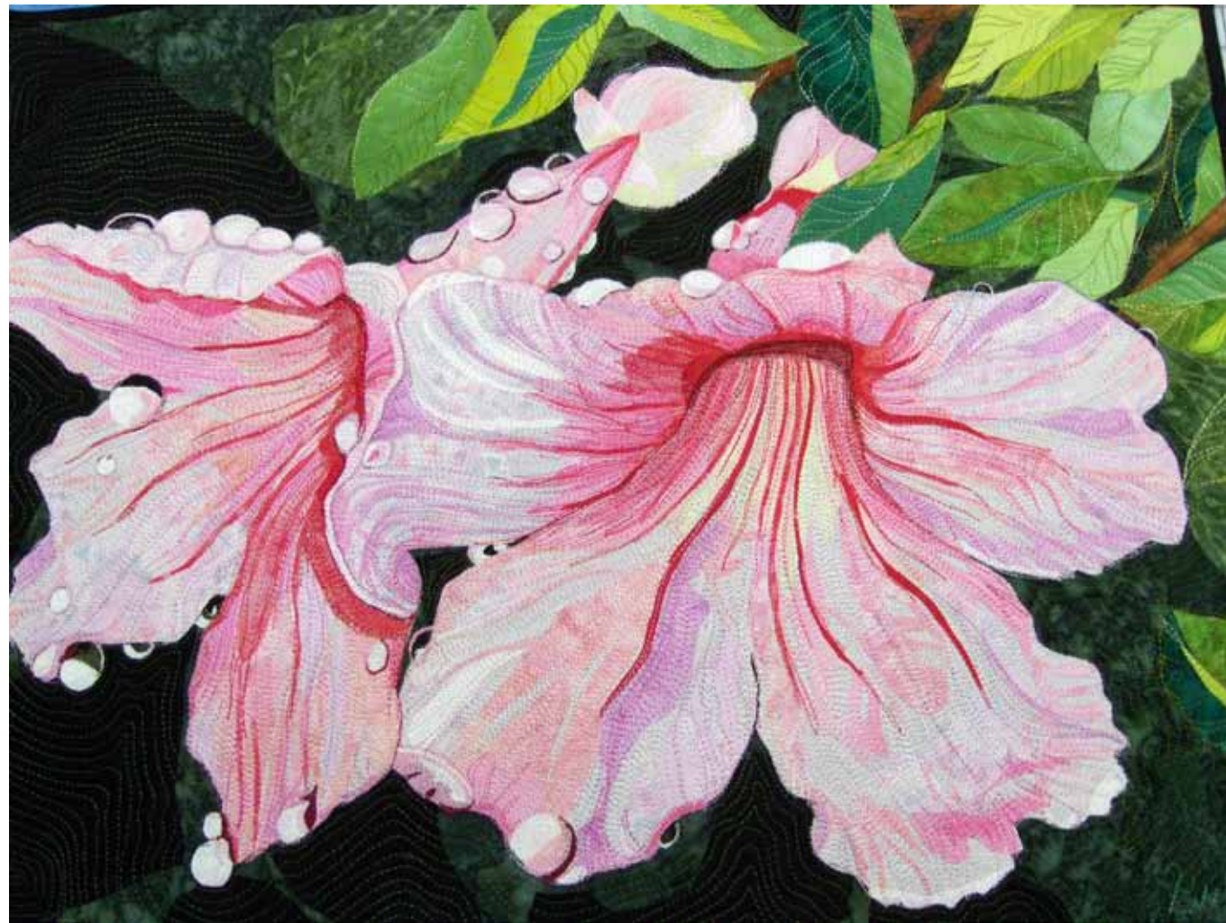
MELINDA BULA ● RAIN DROPS, 2010 ● 23 x 25 inches (58.4 x 63.5 cm) ● 100% cotton fabrics (some hand dyed by the artist), rayon thread; thread painted, fusible appliqué ● Photo by artist