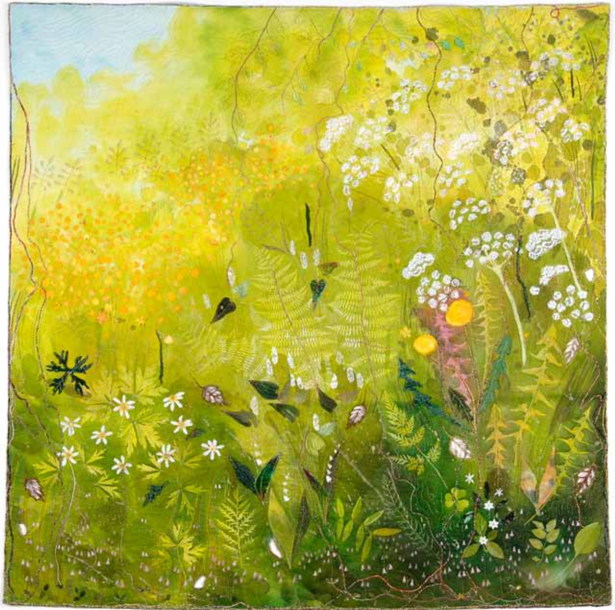
MAIJA BRUMMER ● PRIMAVERA, 2005 ● 40 x 40 x 3/16 inches (101.6 x 101.6 x 0.5 cm) ● 100% cotton surface and backing; hand dyed, hand painted, free-motion machine embroidered