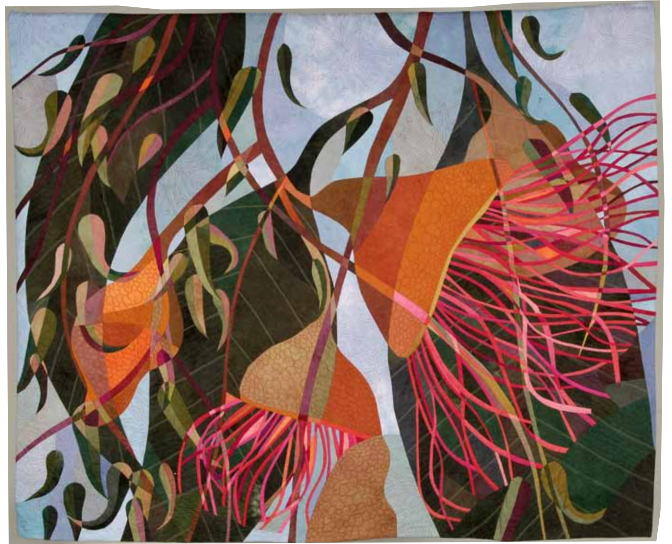
RUTH DE VOS ● SOLOMON..., 2007 ● 58½ x 71⅞ inches (148.6 x 181.5 cm) ● 100% cotton, dye; hand dyed, machine pieced, machine quilted