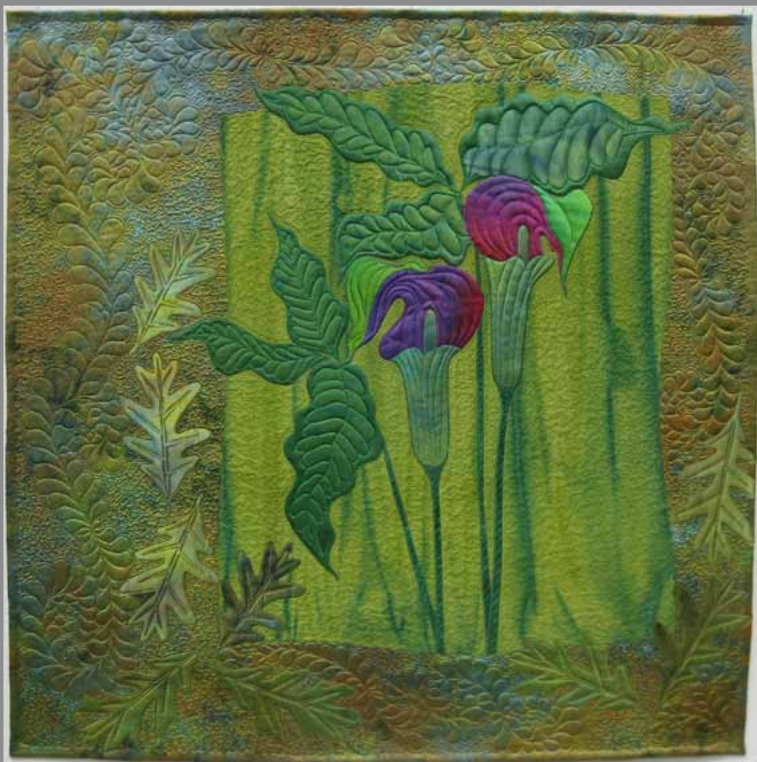
FRIEDA ANDERSON ● WOODLAND SECRETS, 2010 ● 43 x 43 inches (109.2 x 109.2 cm) ● Cotton and silk; hand dyed, machine appliquéd, machine quilted ● Photo by artist