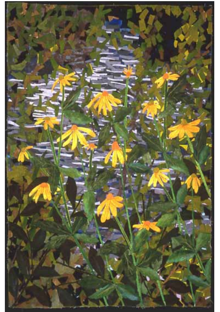
GEORGIE CLINE ● WHOLE I: YELLOW FLOWERS I, 2004 ● 39 x 29 inches (99.1 x 73.7 cm) ● Cotton- and silk-blend commercial and hand-dyed fabric, tulle, acrylic paint, metallic fabric paint; machine appliquéd ● Photo by artist