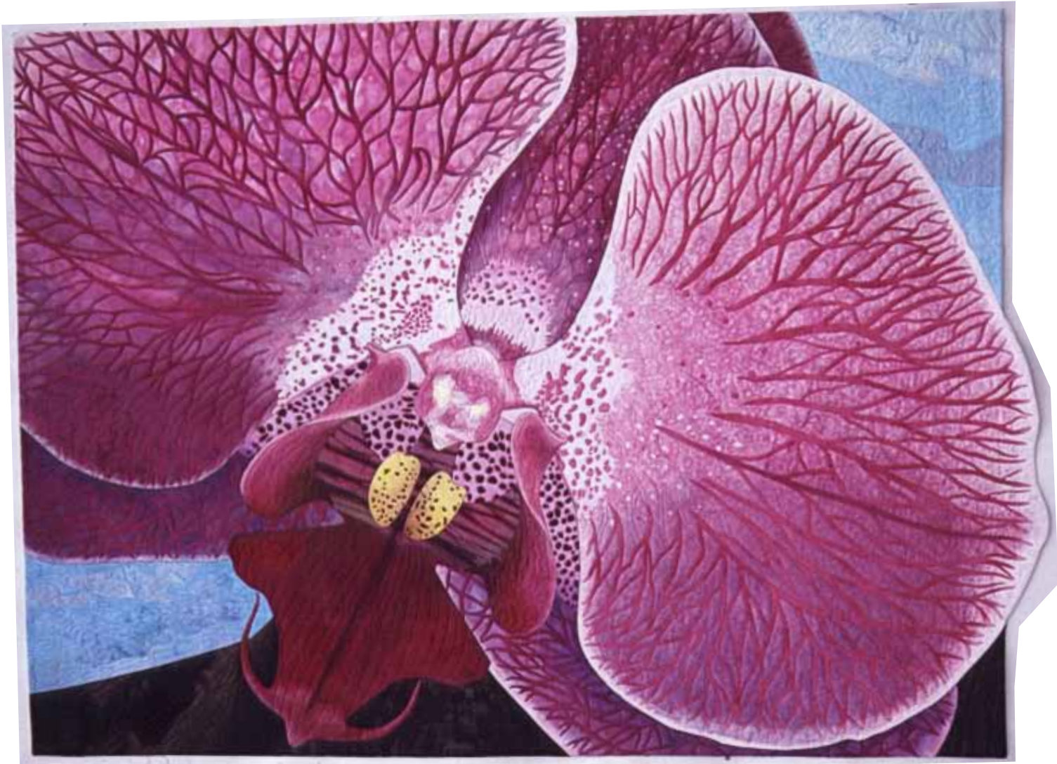
DEBRA DANKO ● PINK ORCHID, 2006 ● 36 x 49 inches (91.4 x 124.5 cm) ● Cotton fabrics, shibori cotton fabric, cotton batting; painted, fused, hand dyed, machine quilted ● Photo by artist