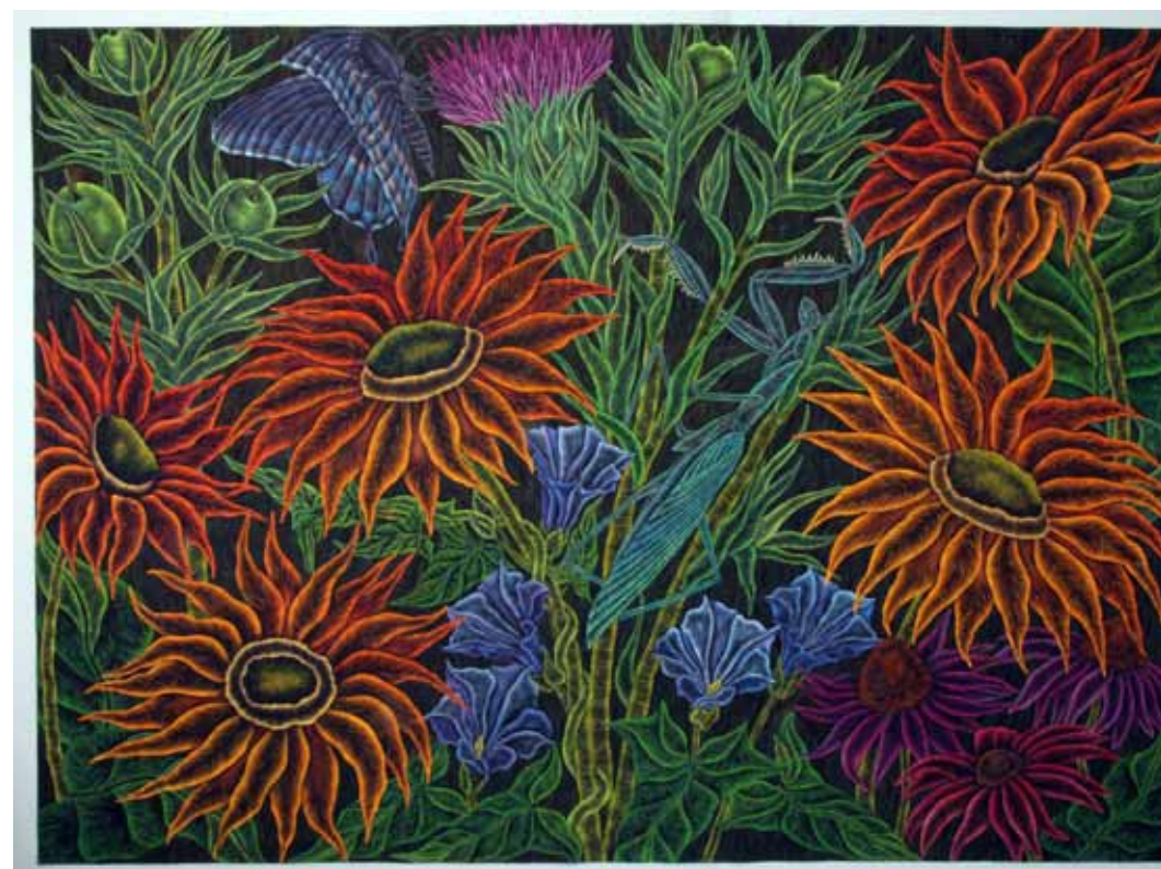
RITA STEFFENSON ● TWILIGHT, 2008 ● 79 x 108 x ¼ inches (200.7 x 274.3 x 0.6 cm) ● 100% cotton, fabrics dyed and painted by the artist; machine appli- quéd, machine quilted ● Photo by Kevin Steffenson