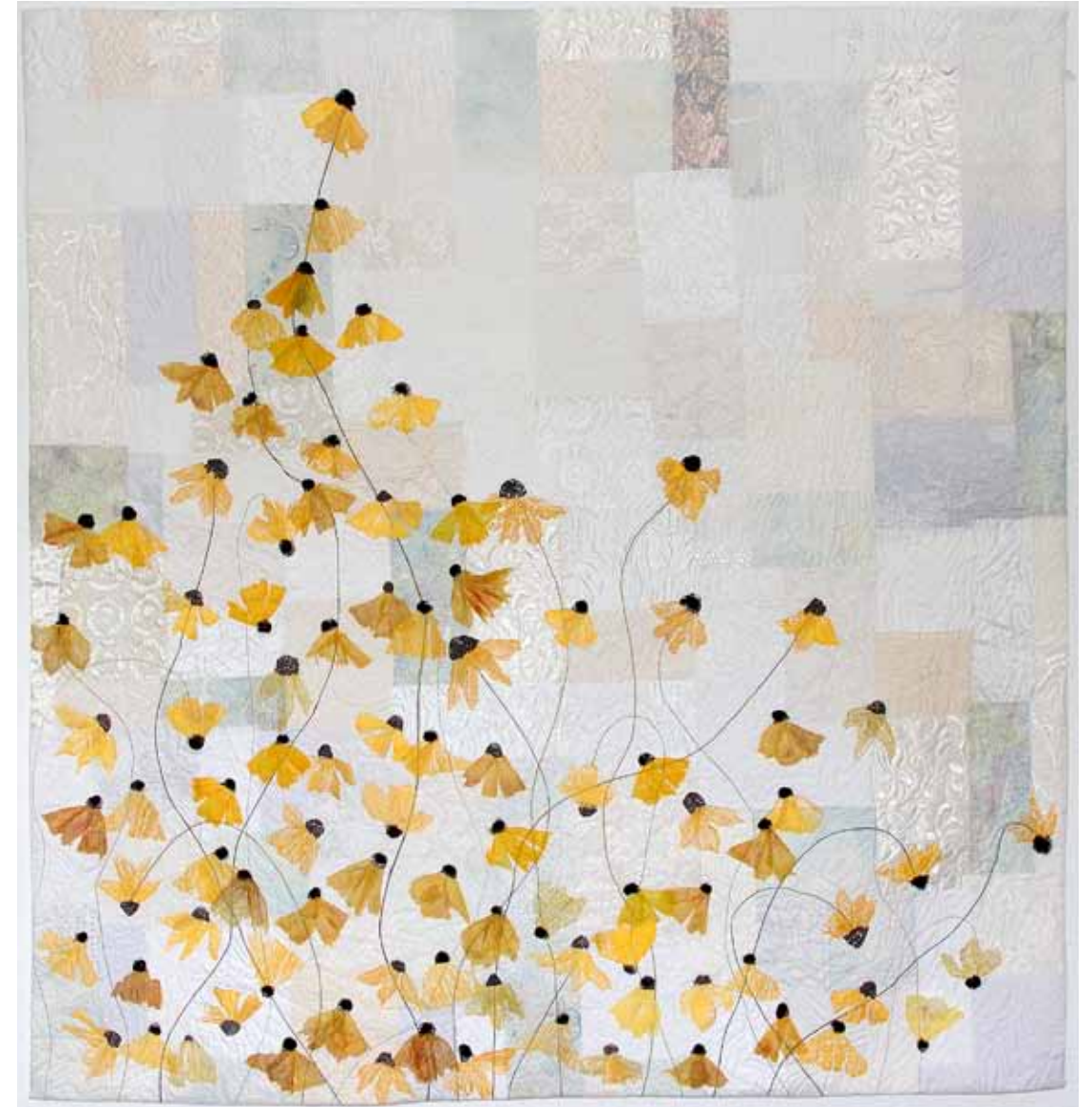
ELSBETH NUSSER-LAMPE ● STRUGGLE, 2010 ● 43 x 43 inches (109.2 x 109.2 cm) ● Cotton and silk; hand dyed, machine appliquéd, machine quilted ● Photo by artist