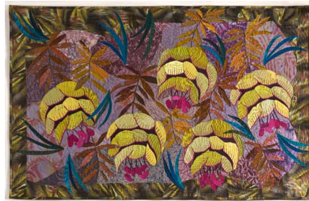
DEBORAH SCHWARTZMAN ● JUICY FRUIT, 2003 ● 38 x 58½ inches (96.5 x 148.6 cm) ● Silk, cotton, rayon, organza, polyester, silk thread; hand stamped and dyed, machine pieced, hand and machine quilted, machine embroi- dered, embellished, fused ● Photo by John Carlano