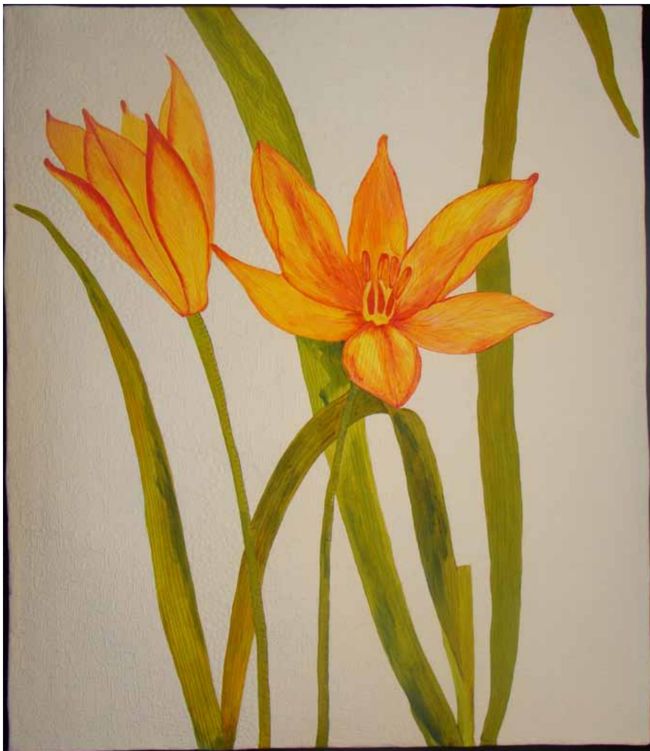
JUANITA YEAGER ● LILIES IN BLOOM, 2009 ● 45 x 38 inches (114.3 x 96.5 cm) ● Silk broadcloth; dye painted, machine quilted ● Photo by artist