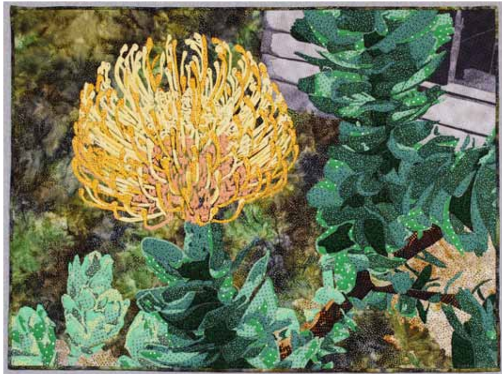
KATHLEEN MCCABE ● PROTEA, 2009 ● 31 x 41 inches (78.7 x 104.1 cm) ● 100% cotton, commercial fabrics; fused and machine appliquéd, machine quilted ● Photo by Phil Imming