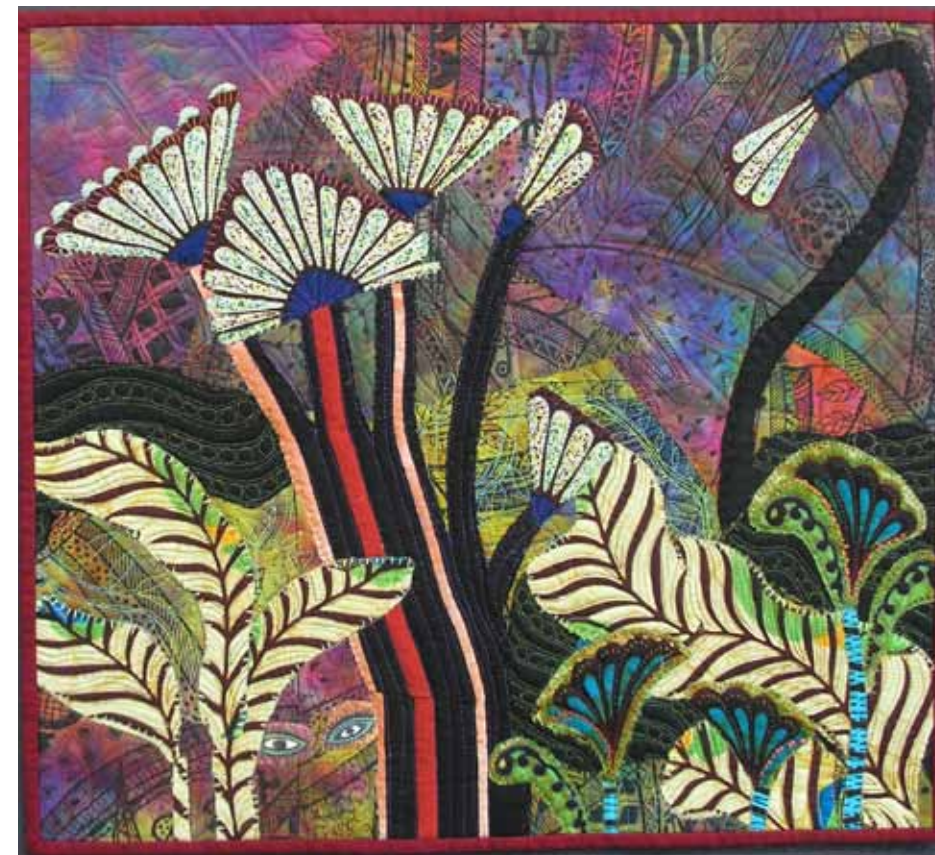
PAMELA ALLEN ● ODD GARDEN, 2010 ● 43 x 43 inches (109.2 x 109.2 cm) ● Cotton and silk; hand dyed, machine appliquéd, machine quilted