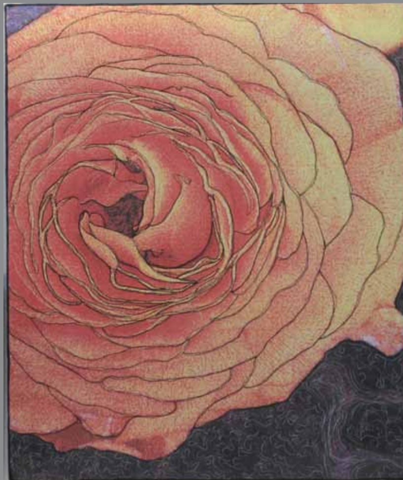
BETH WHEELER ● LABYRINTH, 2008 ● 30 x 24 x 1 inches (76.2 x 61 x 2.5 cm) ● Cotton twill, fleece batting, photograph; computer manipulated, printed, free-motion machine stitched ● Photo by artist