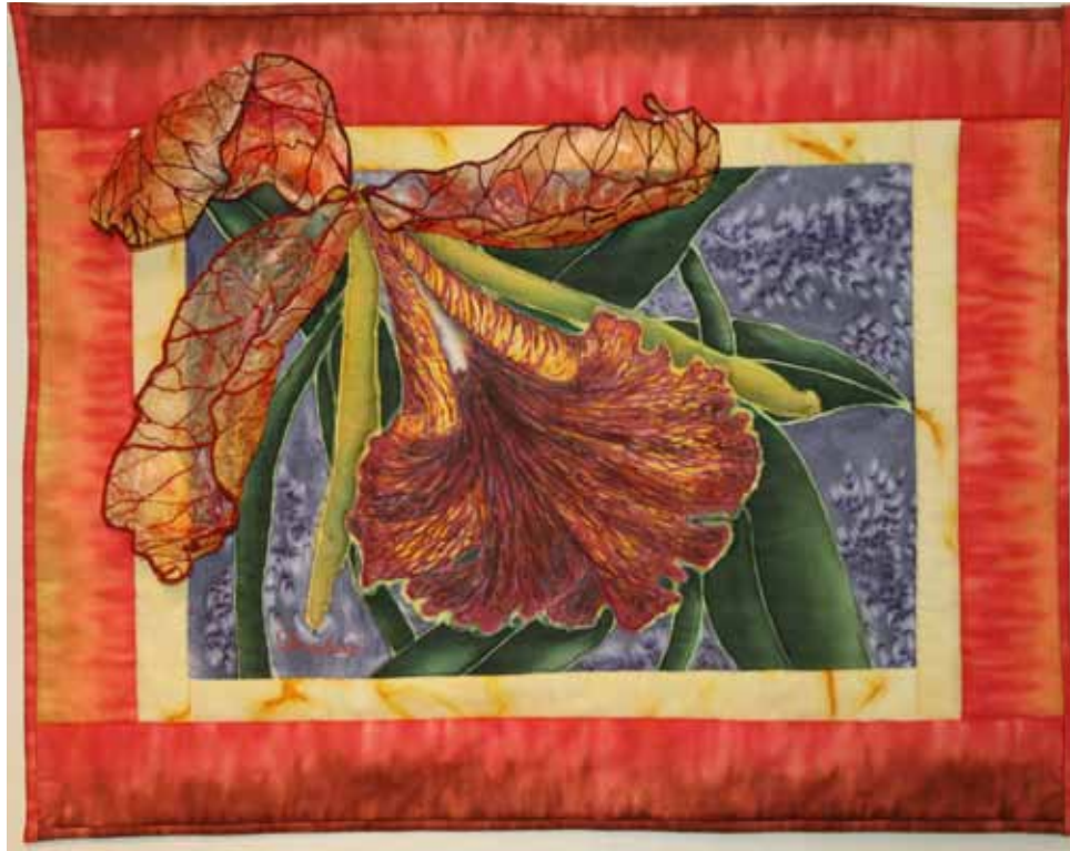
SMADAR KNOBLER ● MAJESTIC LEYA, 2010 ● 25 x 32 x 4 inches (63.5 x 81.3 x 10.2 cm) ● 100% silk, 100% cotton, paint, wire; machine pieced and quilted ● Photo by artist