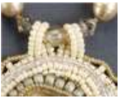
Herringbone Loop Attachment DBE pg 80