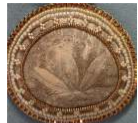
Diamond Bezel BWC pg 68