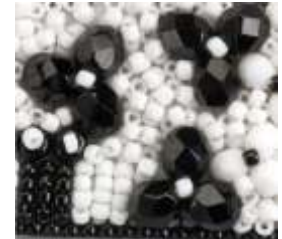
Clover Stitch DBE pg 45