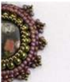
Crown Points Edge DBE pg 66