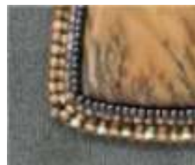
Two Bead Edge BWC pg 21