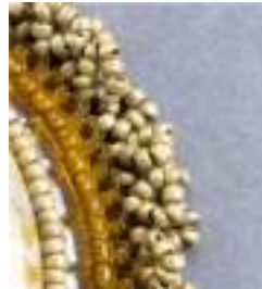
Circles Edge DBE pg 70