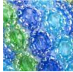
Chain-o-Beads stitch DBE pg 48