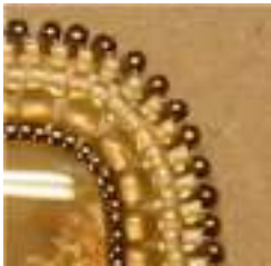
Picot Edge DBE pg 65 BWC pg 21