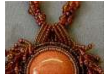
Top Loop Attachment BWC pg 57