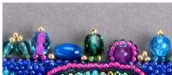
Free Form Edge DBE pg 75