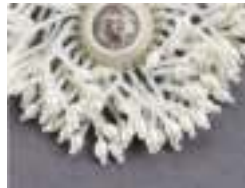
Branch Fringe DBE pg 77