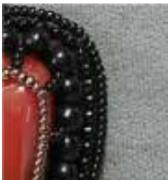
Turn Bead Edge BWC pg 25