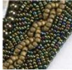
Braid Stitch DBE pg 46