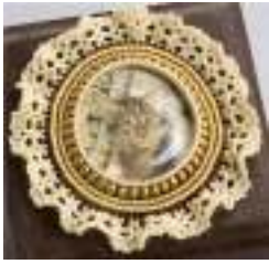
Lace Ruffle Edge DBE pg 71