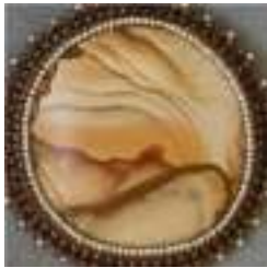
Plain/Standard Bezel DBE 49