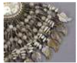
Loop Fringe DBE pg 77