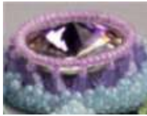
Stacks Bezel DBE pg 54