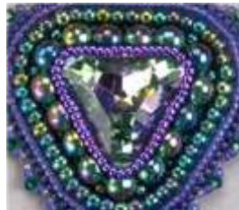
Bead Raised Bezel BWC pg 61