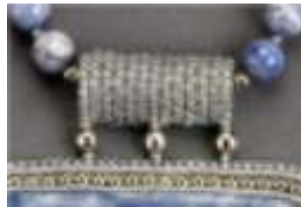
Square Stitch Bail DBE pg 82