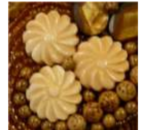
One Bead Stitch DBE pg 36