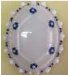
Flower Bezel DBE pg 60