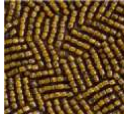
Lazy Stitch DBE pg 43