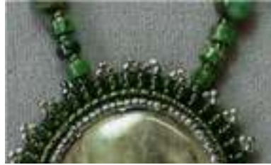
Direct Attachment BWC pg 47