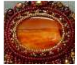
Picot Bezel BWC pg 66