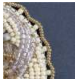
Wave Edge DBE pg 73