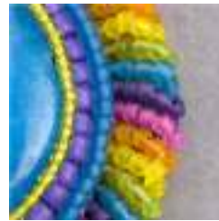
Rope Edge DBE pg 68