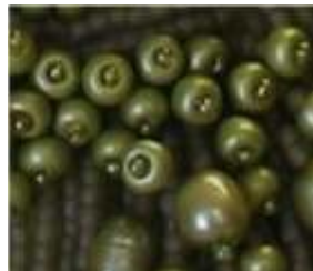
Stacks Stitch (aka Fringe Stitch) DBE pg 37