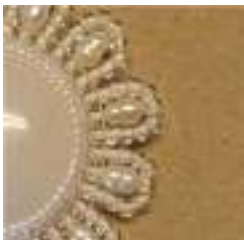
Scalloped Edge BWC pg 41