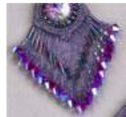
Fringe Edge DBE pg 77 BWC pg 44