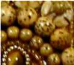
Couch Stitch DBE pg 40 BWC pg 62