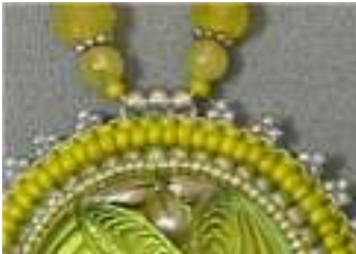
Turn Bead Attachment BWC pg 50