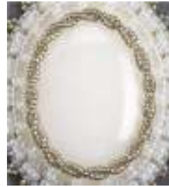
Twisted Bezel DBE pg 52