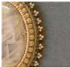
Pointed Edge BWC pg 29