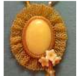
Ruffled Edge BWC pg 38