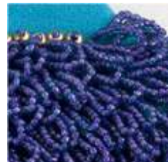
Loop Stitch DBE pg 42