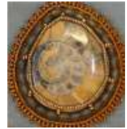
Window Bezel BWC pg 64