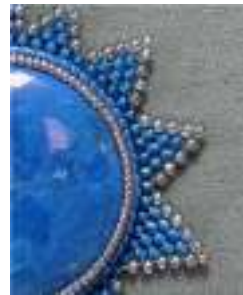
Star Edge with Brick Stitch BWC pg 35