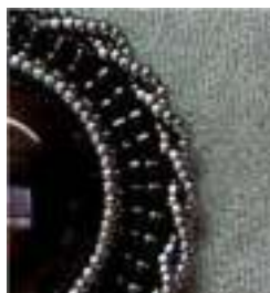
Twisted Edge BWC pg 32