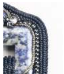
Sunshine Edge (Aka Basic/Raw Edge) DBE pg 65 BWC pg 20