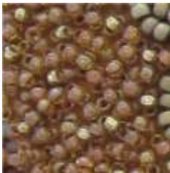
Picot Stitch (aka Moss Stitch) DBE pg 41