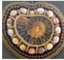
Outside Window Bezel DBE pg 50