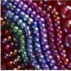
Backstitch DBE pg 38, BWC pg 16,18