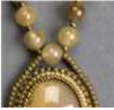
Added Bead Attachment DBE pg 85