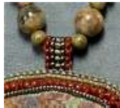
Ladder Stitch Top Bail BWC pg 55