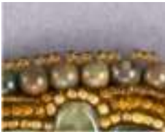
4mm Fill Edge DBE pg 65