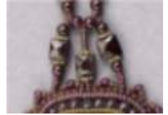
Fringed Turn Attachment DBE pg 87