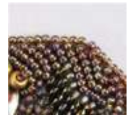
Clean Edge DBE pg 63