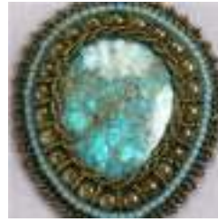
Outside Window Twisted Bezel DBE pg 53