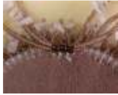
Backside Bead Attachment BWC pg 53