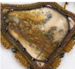
Bead Across Bezel DBE pg 58