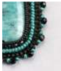
Side Petal Edge DBE pg 67