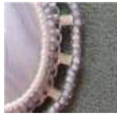
Lifted Turn Bead Edge BWC pg 27