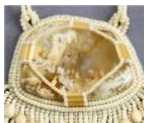
Bugle Row Bezel DBE 56